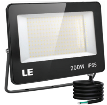
340009-DW-US 200 W