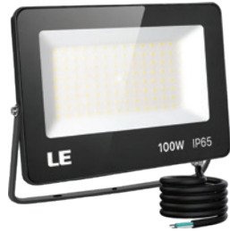
340007-DW-US-2 100 W