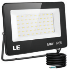
340003-DW-US-2 50 W