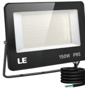
340008-DW-US 150 W