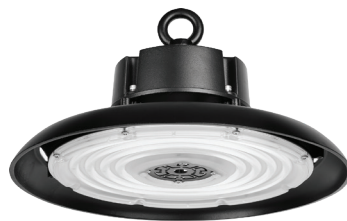
350010-NW-US 150 W