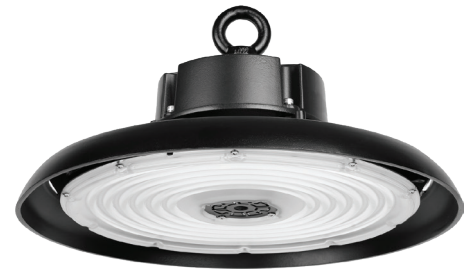
350011-NW-US 240 W