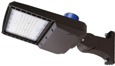
620001-NW-US-LC 100 W 620002-NW-US-LC 150 W