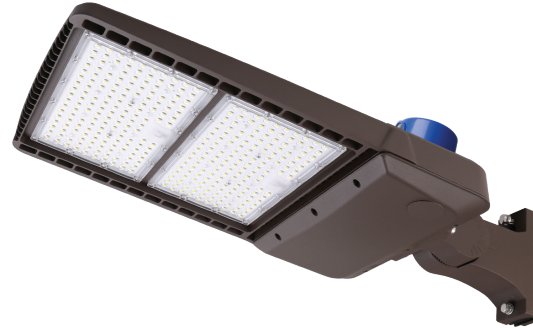
620003-NW-US-LC 200 W 620004-NW-US-LC 300 W