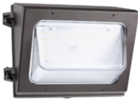
630009-NW-US 40 W