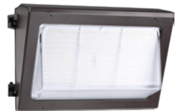
630011-NW-US 120 W